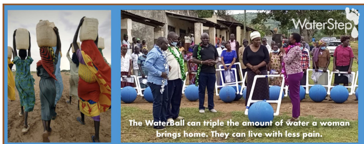
The WaterBall can triple the amount of water a woman brings home. They can live with less pain.